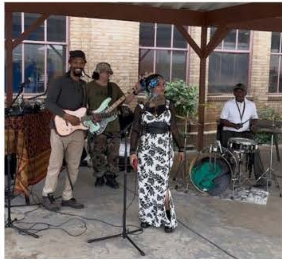
Above: Ambassador Arts Band of Heroes and Venus Sublime keep it groovy