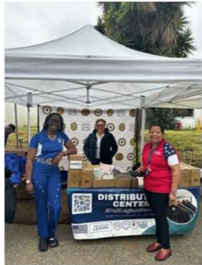
Above: American Legion Auxiliary Post 238 with toiletries, cosmetics, and care products for women veterans