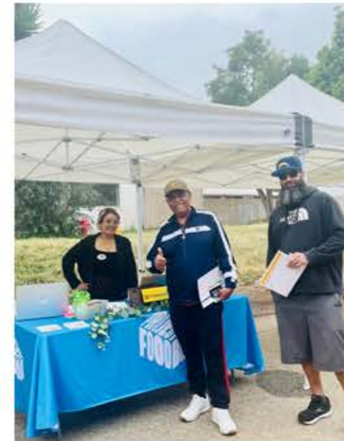
Right: Veterans mingle with partner organizations and receive vital essentials, services, and information