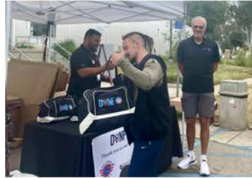
Care packages and hygiene bags distributed by the Disabled Veterans National Foundation (DVNF)