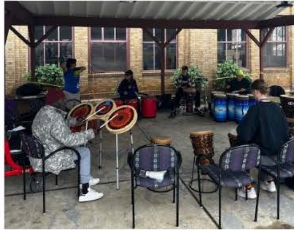
Veterans jam out with Wahlbangers Drum Circle