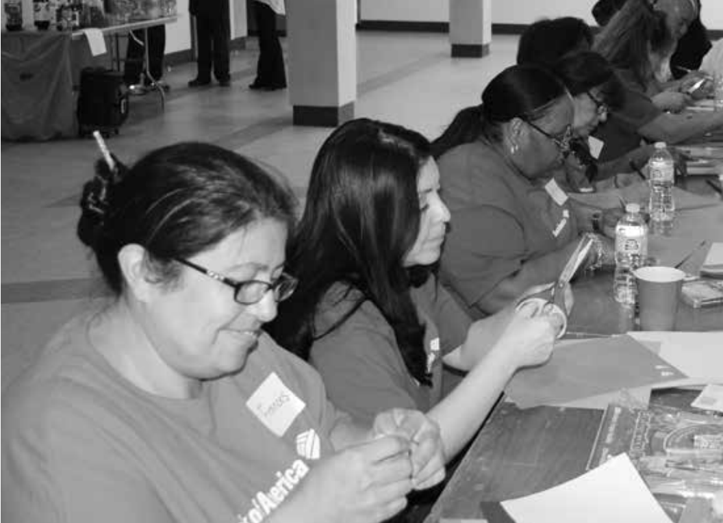
Bank of America volunteers prepare welcome home kits for veterans moving into permanent supportive housing.